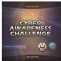
CyberAwareness Challenge (for DoD and Federal Personnel) October 2012