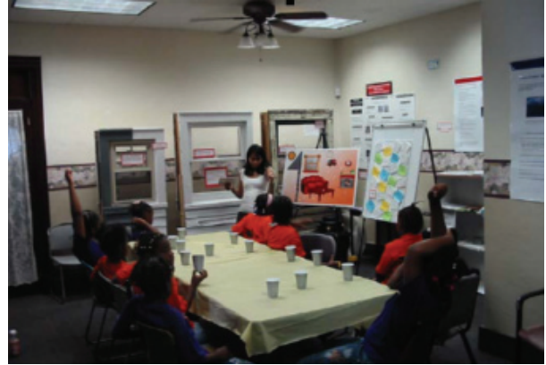
Tour guide plays a post-tour game with youth.

Senior Program Staff/Principal Investigators. An organization's leadership team needs to be briefed regularly on the program's ability to meet deliverables, lessons learned, and implementation challenges faced by the program. Senior staff members fulfill a critical role in disseminating findings to elected and non-elected officials, the media, potential funders, and community representatives. These stakeholders need quantitative data to answer questions about scope, effectiveness, and cost of services. But they also need qualitative or testimonial data in order to "put a face on the