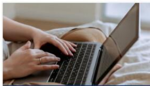
Landlord Newsletter Sign Up