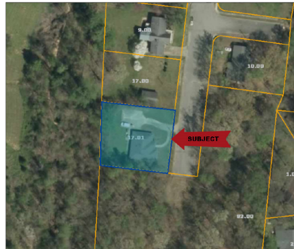
Aerial View of property