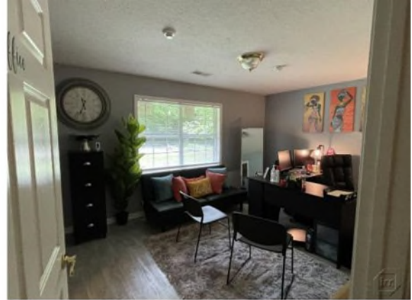
Bedroom (utilized as office)