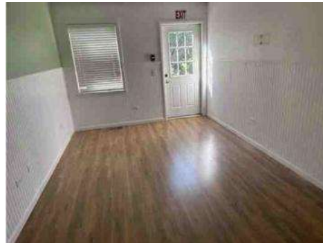
Second Floor Loft