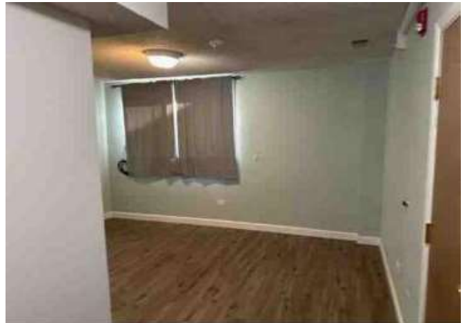
Basement Bedroom 2