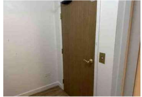
Elevator – Basement Floor