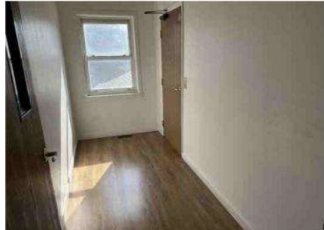
Elevator – Second Floor