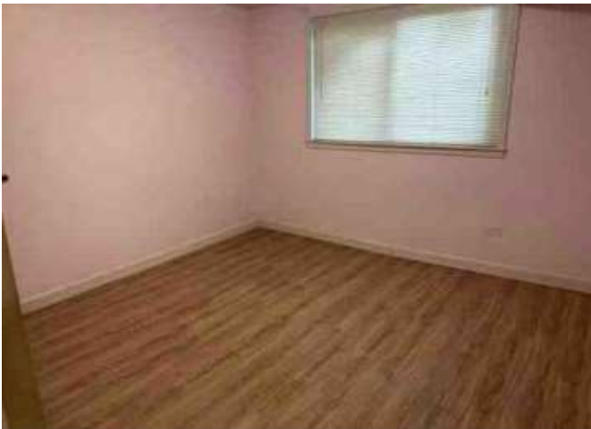
Basement Bedroom 1