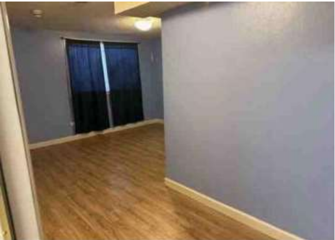
Basement Bedroom 3