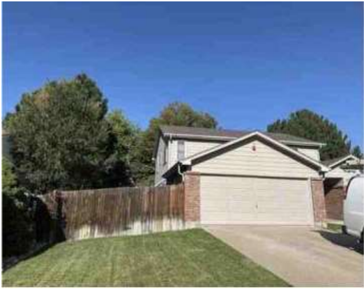
Exhibit 2 Developmental Pathways II - Parcel A Photos 11204 E. Colorado Drive, Aurora, Colorado 80012