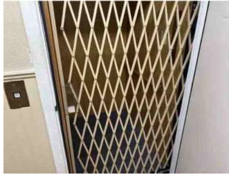
Elevator – Interior Door