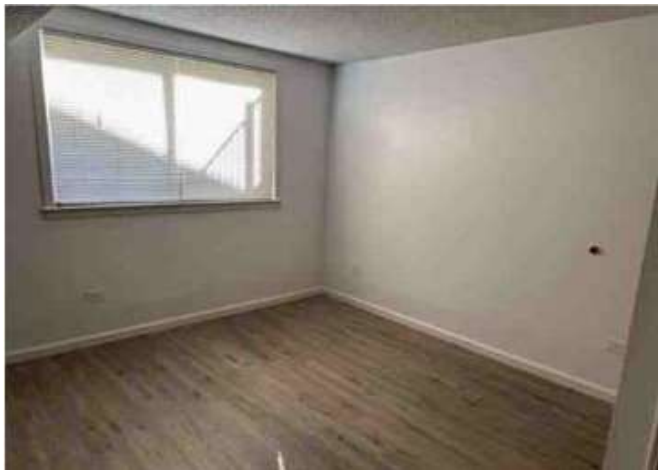
Basement Bedroom 1