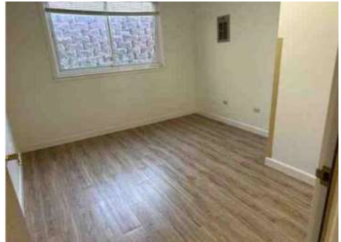
Basement Bedroom 2