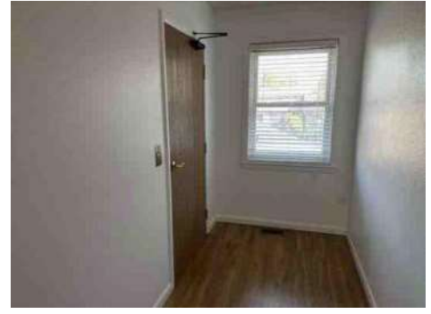
Elevator – Second Floor