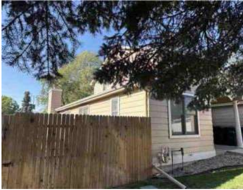
Exhibit 2 Developmental Pathways II - Parcel B Photos 11204 E. Colorado Drive, Aurora, Colorado 80012