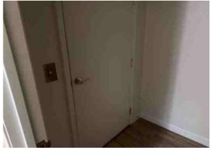
Elevator – Basement Floor