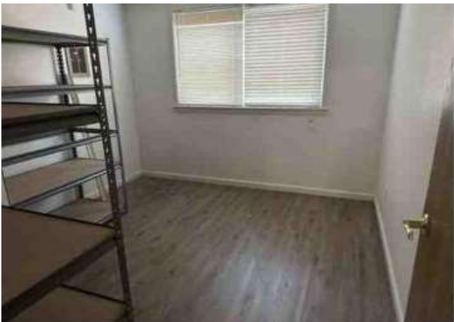
Basement Rec Room