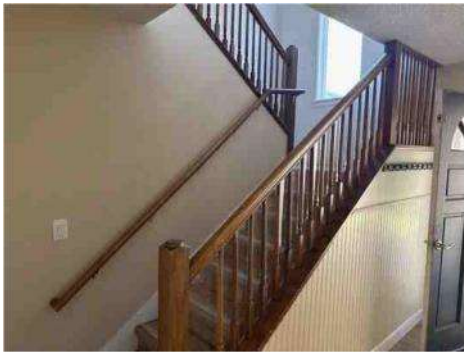
Stairs to Second Floor