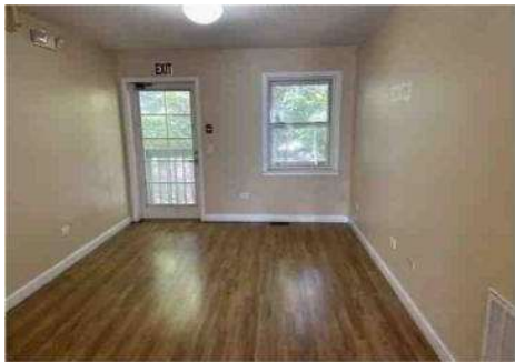
Loft – Second Floor