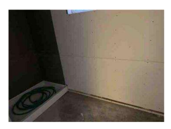
Basement - Roughed in Bath