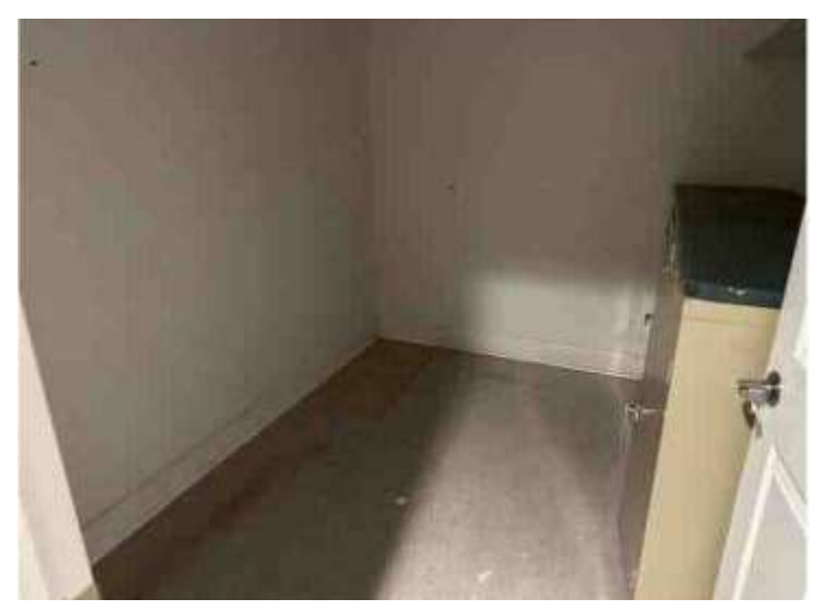
Storage (main floor)