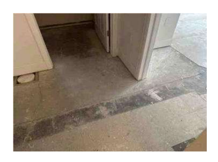
Basement - concrete flooring