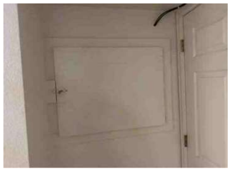
Crawl Space Access